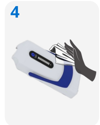
4 Dry battery module with: