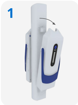
1 Remove Power module

! * If in doubt regarding this step please remove battery from service and contact technical support.