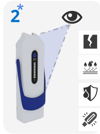
2* Inspect for cracks or damage.

Press the release button located at the top of the dock .